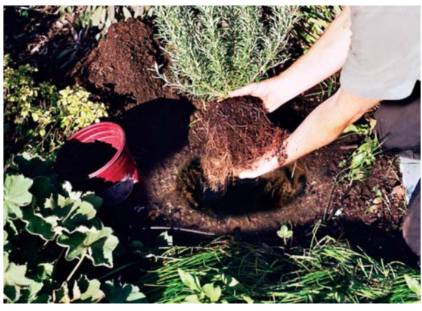
Dig a hole as deep as the root mass and twice as wide, and spread the roots out before planting.

Prepare the soil by mixing 20-25% compost into soil in planting beds. (For trees and shrubs, mix compost into the whole planting bed, or just plant in native soil and mulch well. Don't add compost just to their planting holes – that can limit root growth.) Then spread out the roots, add water, and tamp soil back in for good root contact. Set plants so the soil level is at the same height on the stem as at the nursery, to prevent problems. Mulch new plantings well, and be sure to water even drought tolerant plants during their first few summers, until they build deep roots.