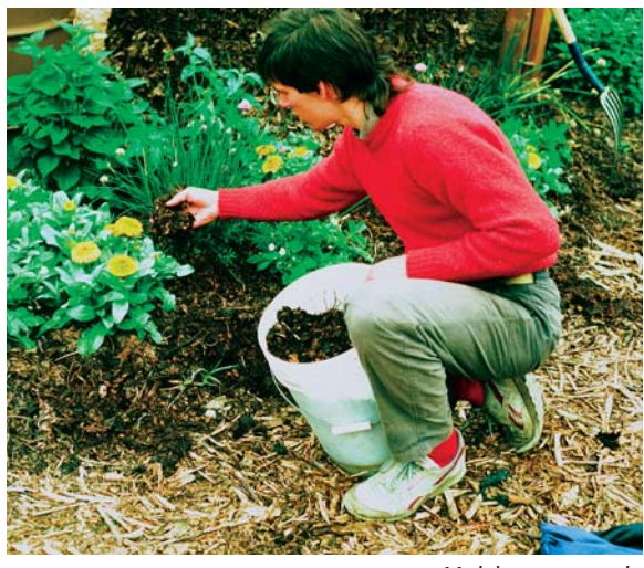
Mulch stops weeds, conserves water, and builds healthy soil for healthier plants. Spread mulch several inches deep and 1 inch away from plant stems.