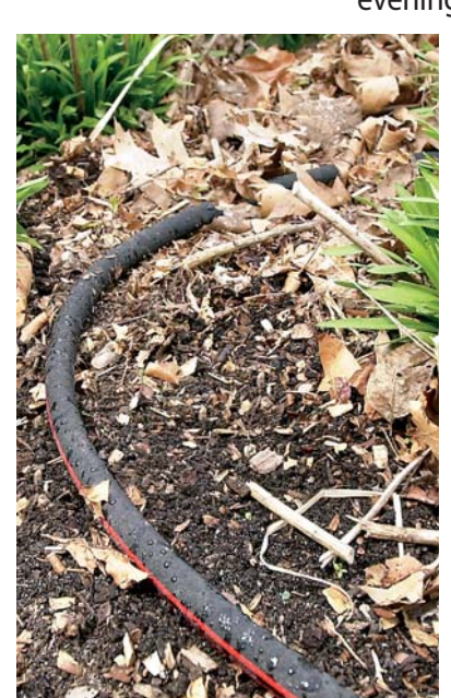
Soaker hoses save water! Cover them with mulch to save even more.