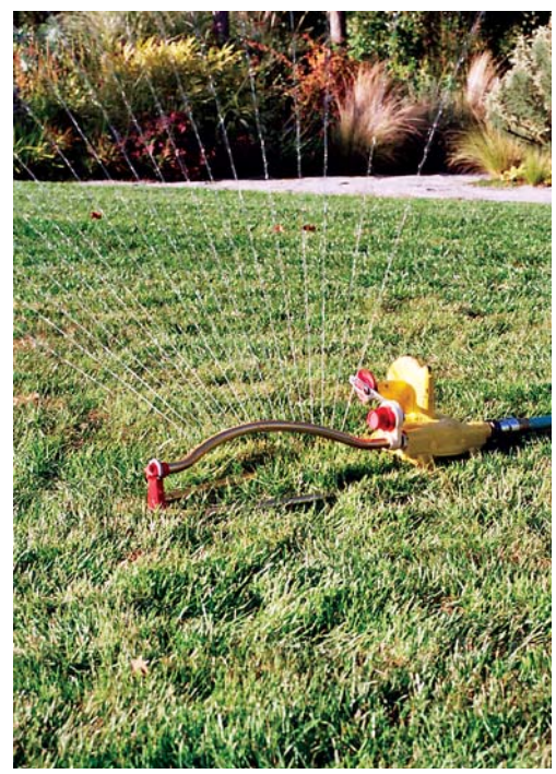
Water in early morning or evening to reduce evaporation.

Adjust the watering schedule at least once a month through the season – plants need a lot less water in May and September than they do in July and August.