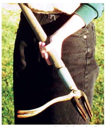
Long handled weed pullers pop dandelions out easily.