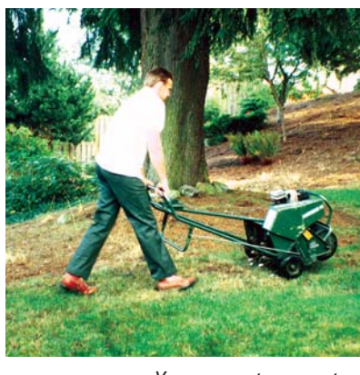
You can rent an aerator, or get a yard service to aerate for you.