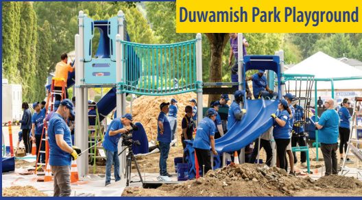
Duwamish Park Playground