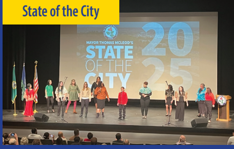
State of the City