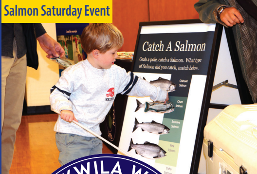
Salmon Saturday Event