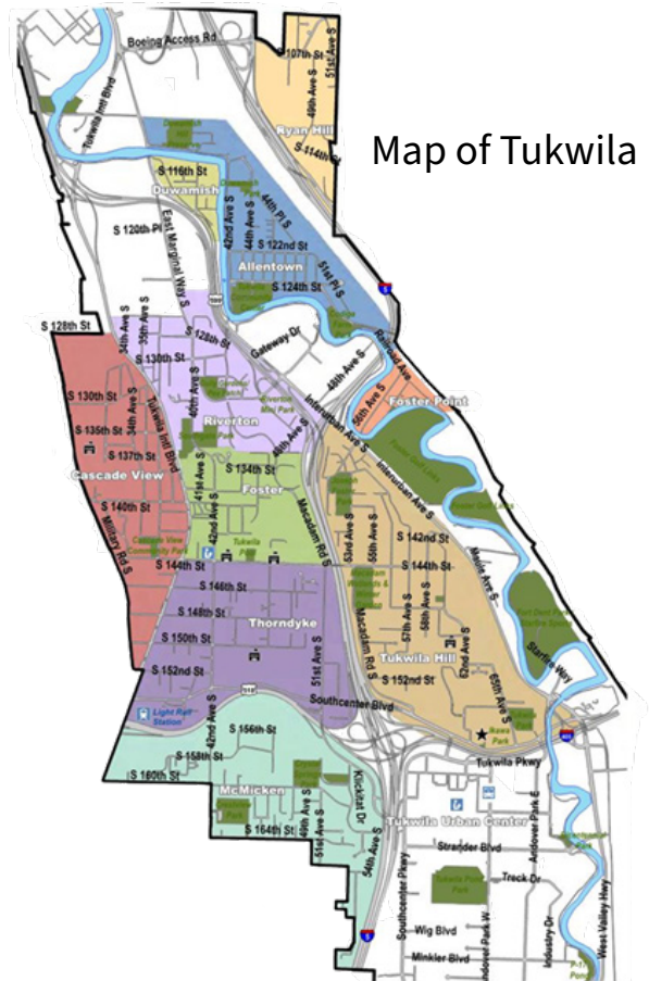
Map of Tukwila