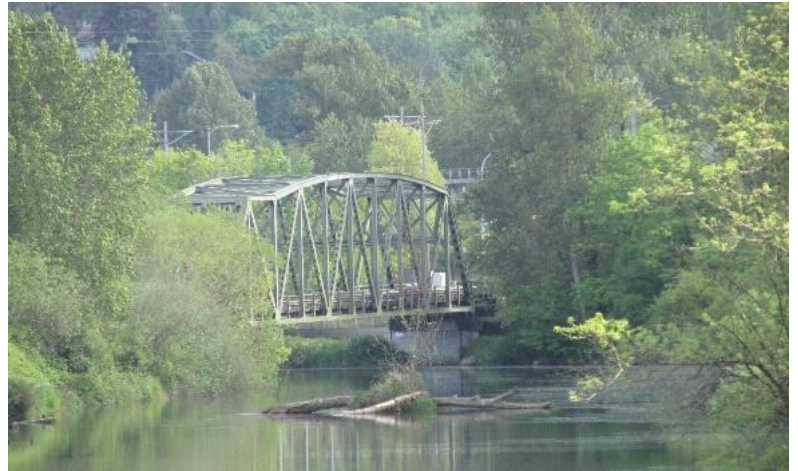
Existing 42nd Ave S Bridge

The 42nd Ave S Bridge is an important arterial that crosses the Duwamish River and connects the City of Tukwila to surrounding communities and resources. The bridge, built in 1949, is reaching the end of its life span and needs to be replaced. In April 2017, the existing bridge received a sufficiency rating of 7.56 out of 100 and is considered Structurally Deficient and Functionally Obsolete by the Federal Highway Administration. The City is exploring options for a new bridge design and will be gathering feedback from the public on a variety of project features.